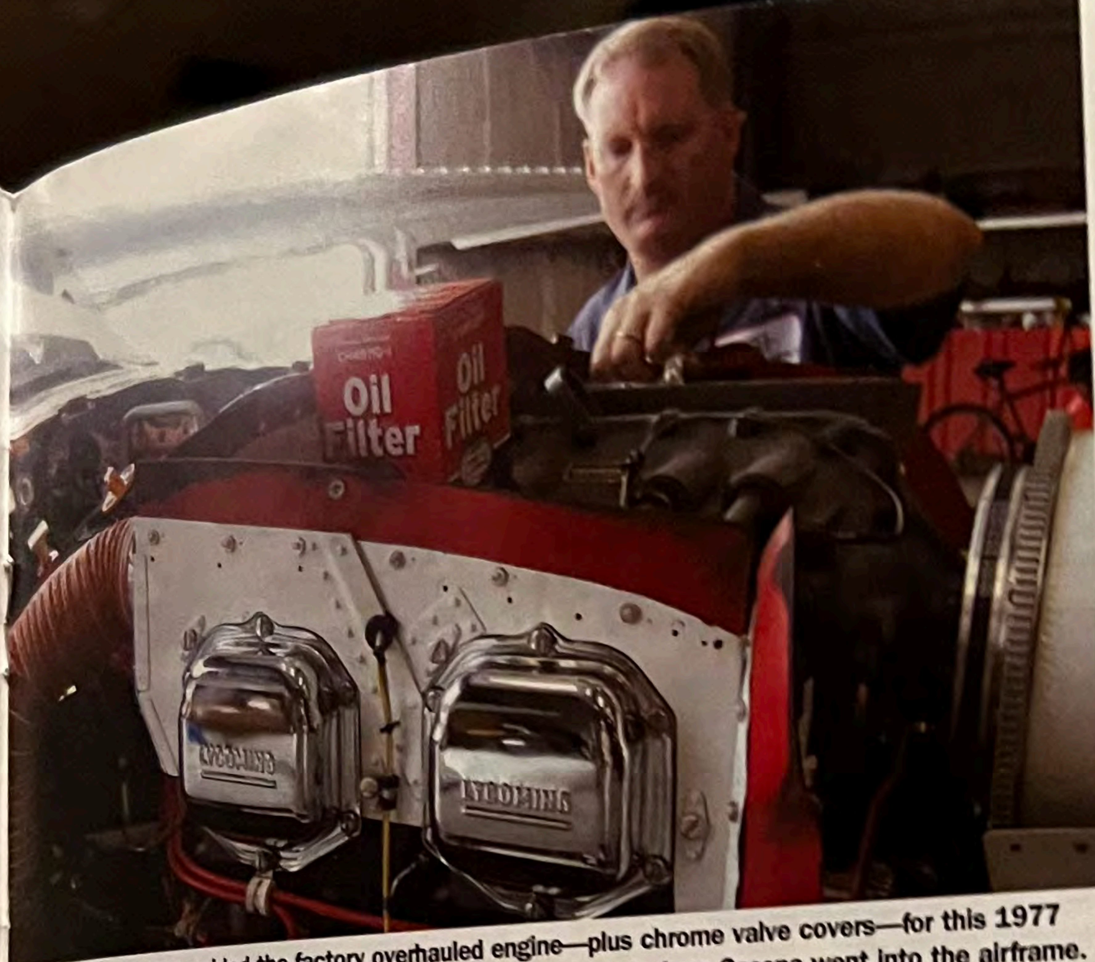
Lycoming provided the factory overhauled engine—plus chrome valve covers—for this 1977 Cessna Cardinal. A parts catalog full of new components from Cessna went into the airframe.

eous paint application you l summer at shows and on oduct of Dias's efforts—and n consider it finished at the ed the final detailing for late at the winner gets a pristine s company is barely a year onation in labor and mate- xcess of $35,000.